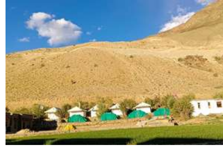
Dolma camp and resort