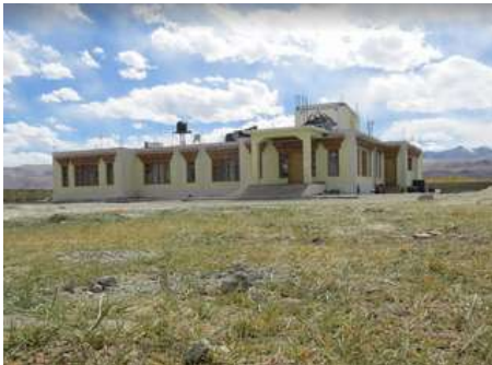
The Hor Cottage