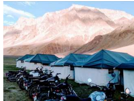
Dorjee Camp or similar