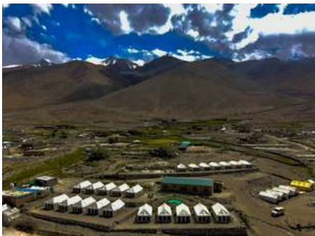
Pangong Heritage camp