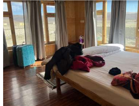
The Hor Cottage