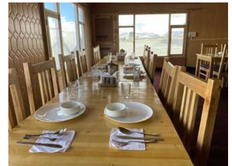
Frozen Pangong Camp