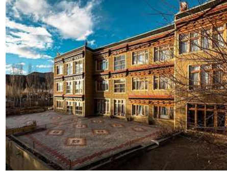
Alpine Ladakh Hotel