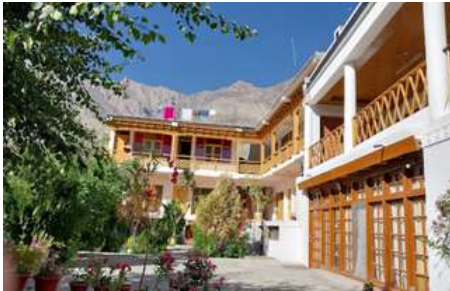
Sand dune hotel