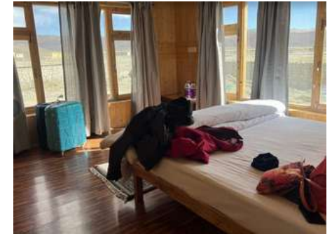
The Hor Cottage