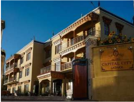
Capital City Hotel