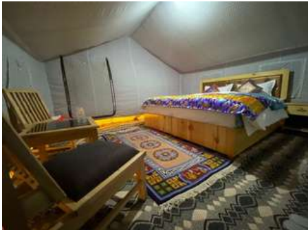
Frozen Pangong Camp