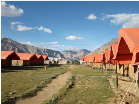
Dorje Camp or Gold-drop camp serchu