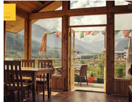
Keylinga inn Manali