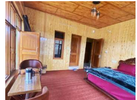
Grand Baspa resort/Baspa mud house