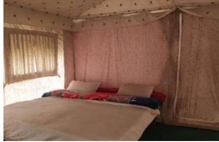
Dare the Himalaya