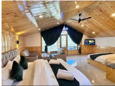
Green alpine/Upvassa Woods