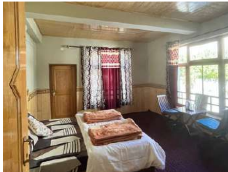
Tenzin Brothers / Yiga Homestay